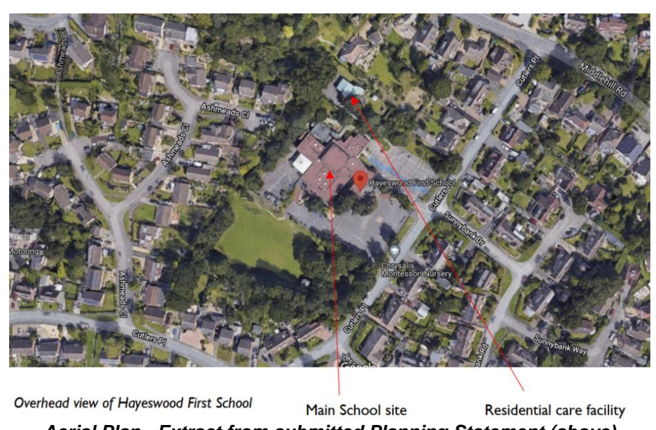
Aerial Plan - Extract from submitted Planning Statement (above)